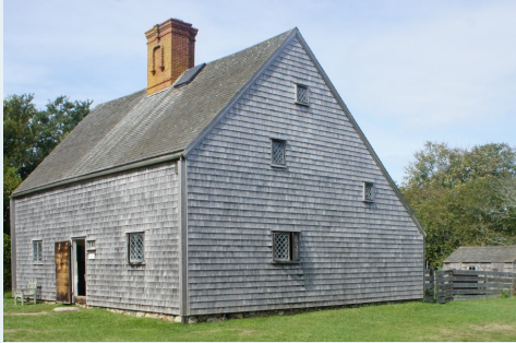
Jethro Coffin House—Built 1686, Nantucket