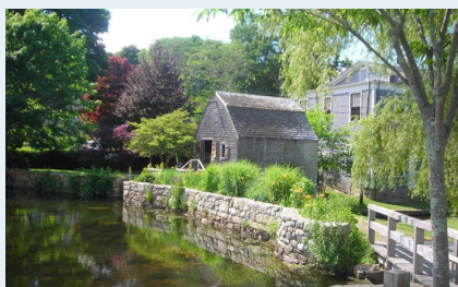
Dexter Grist Mill—Built 1640, Sandwich

Name of Qualifying Ancestor, if known. _____