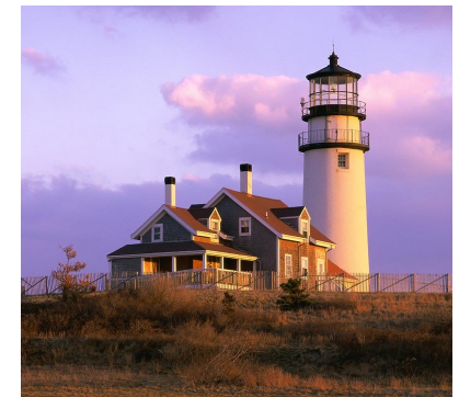
Highland Light—Cape Cod's First Lighthouse